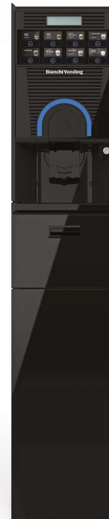
GAIA STYLE EASY + CABINET

♡ A safe break is a break that keeps people smiling: because peace of mind is essential for total enjoyment.