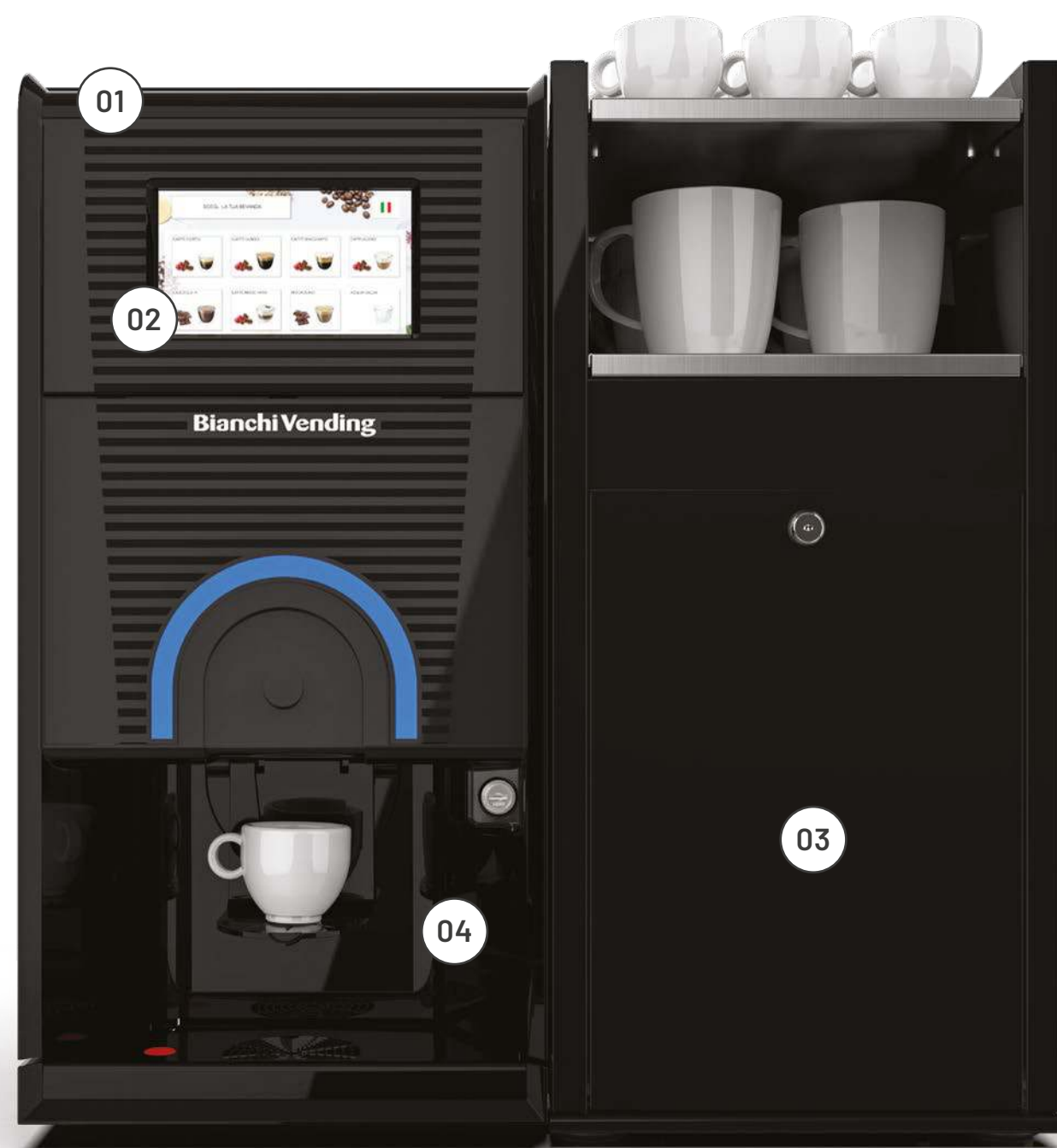
GAIA STYLE RY TOUCH 7" + FRESH MILK MODULE (optional)

Gaia Style Ry renews the pleasure of good company at the office, store or studio: a design element that makes the setting more pleasant, a menu with many possible options providing all the freedom of choice that you could ever want.